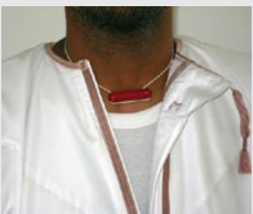
Figure 2: Dosimeter positioned at