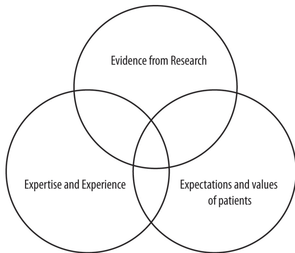
Figure 2: To make clinical decisions all the three components Evidence, Experience and Expectations are required