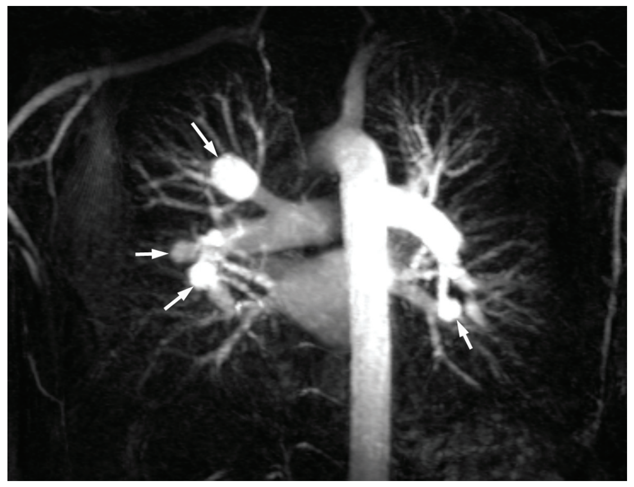
Figure 2: Maximum intensity projection (MIP) of contrast-enhanced Magnetic Resonance angiogram of the pulmonary arteries shows multiple aneurysms (open arrows) of the right pulmonary arterial branches and a branch of the left inferior pulmonary artery

A 30 years old soldier presented with a three-year history of recurrent oral ulcers and stomatitis, recurrent lobar pneumonias with hemoptysis, intermittent fever and weight loss.