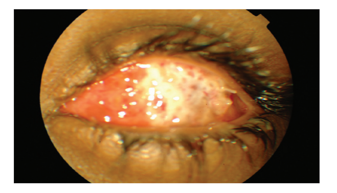
Figure 4: First post-operative day: Graft tissue is well-apposed with the host tissue

In the orbit, special attention should be given when performing this procedure, the most important being to respect the vascular supply of the recipient bed. Thus, it should not be used in any orbit with compromised vascular supply, such as after severe trauma (in particular chemical burns), irradiation, or in patients with systemic vascular disease because the risk of graft atrophy and loss is significantly increased [Table