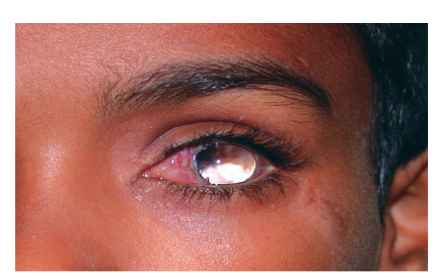
Figure 1: Complete exposure of the polymethylmethacrylate spherical orbital implant after the first surgery

On the first post-operative day, examination showed the graft tissue well apposed with the host tissue [Figure 4], thus the patient was discharged with instructions to use antibiotic eye ointment. When