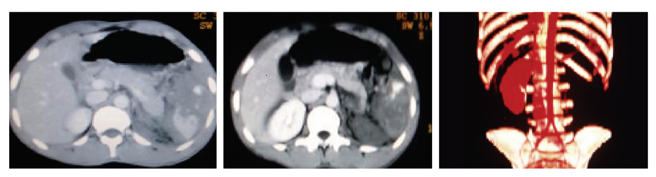
Figures 1-3: Patient with multi organ injury: Grade V renal injury and shattered spleen. Note: The 3D reformat of CT-angio with complete loss of renal vascularisation (left)

Delayed CT scans were also incorporated whenev-