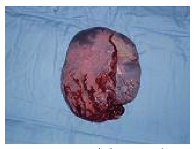
Figure 4: post operative finding, note grade IV splenic rupture

Of the total 245 patients in our study, 219 (89.4%) patients had solid organ injuries (liver, spleen, pancreas or kidneys). CT OIS grading in these patients showed that all 62 patients with grade II injuries were conservatively managed, while 14 patients with grade V injuries were operated. However, the majority, i.e. 143 of these 219 patients, had either grade III or grade IV injuries and these were either managed conservatively or operated on depending on their assessment on an individual basis [Table 3]. Hence, in the overall analysis of solid organ injuries, OIS grading in isola-