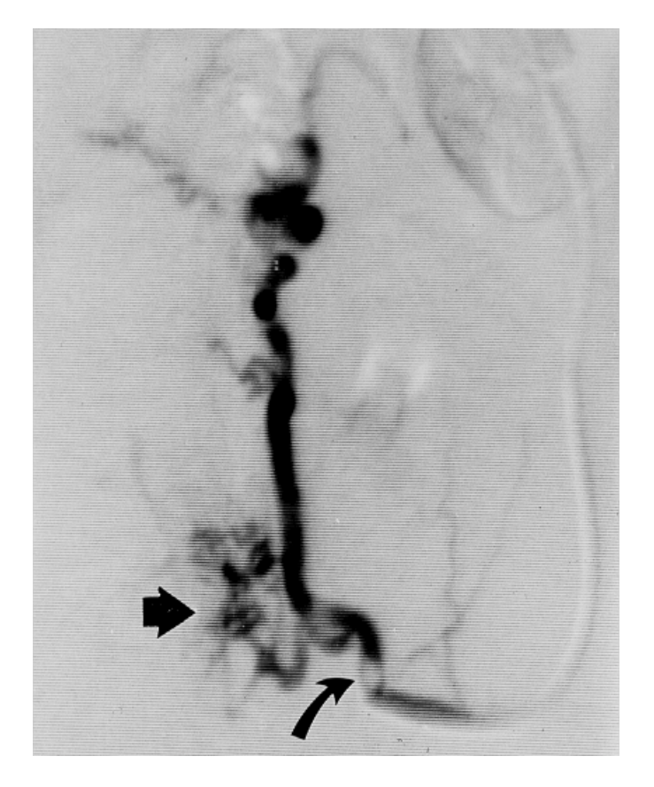
FIGURE 2. Selective angiography of the left uterine artery. The straight arrow points to the placental vasculature in the cervix. Curved arrow indicates a gelfoam at the beginning of embolization.