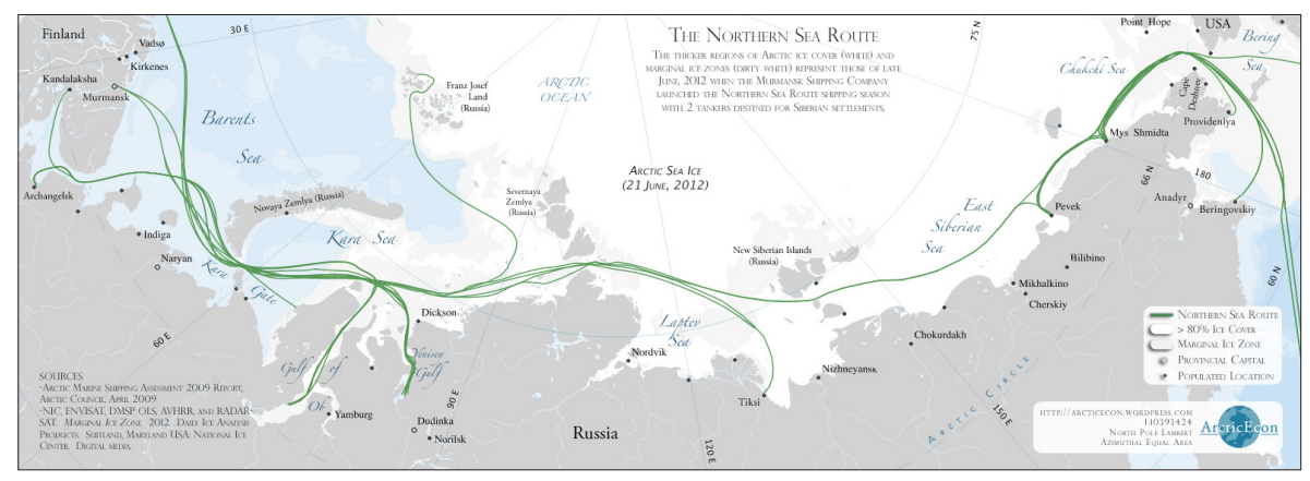
Accessed at ArcticEcon: https://arcticecon.wordpress.com/tag/northern-sea-route/.

While the ice pack is receding in the Arctic, the shrinkage is not in a linear progression from more to less ice. While there is a steady downward trend , in any given year ice conditions can be more severe at particular times than in previous years. The overall record low for the ice pack was in 2012, closely followed by 2011 and 2007.<sup>5</sup> Ice then increased in the two following years, with 2014 having more difficult ice conditions than a year earlier. The extent of the permanent sea ice declined again in 2015, although it was significantly greater than the record lows of other years. While it may be safe to suggest that Arctic routes are now more likely to be open than in the past, it is very difficult to predict exactly what shipping conditions will be from year to year, and at any time in any given month, although the general trend is for more navigation over longer periods of time.