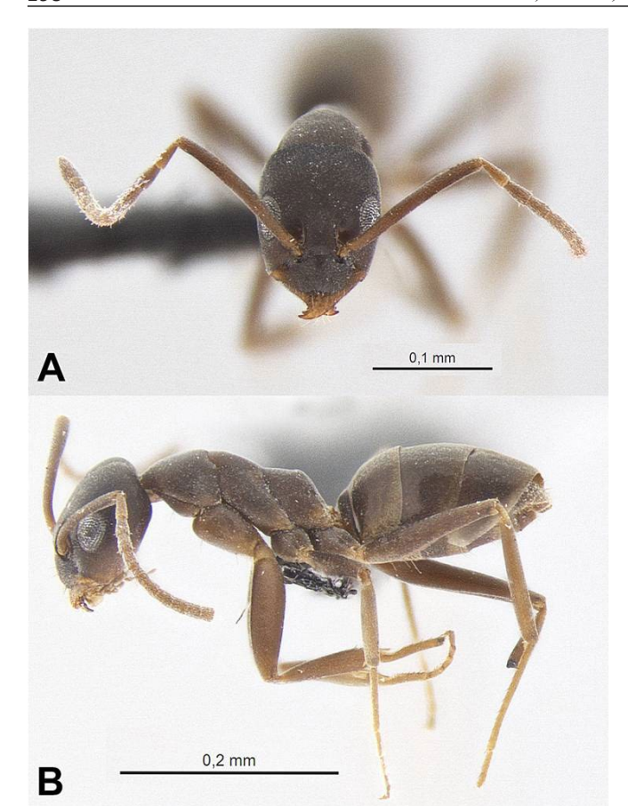
Fig 1. Gracilidris pombero worker (Aceguá, RS, Brazil). A: Head in frontal view. B: Body in profile.

Brazil was reported from the southernmost state of this region, Rio Grande do Sul. This fact suggests that (1) G. pombero probably occurs in PR and SC, but (2) the Atlantic Forest that predominantly cover these states has received the bulk of the sampling effort, while the natural open fields and grasslands of South Brazil remain relatively undersampled.