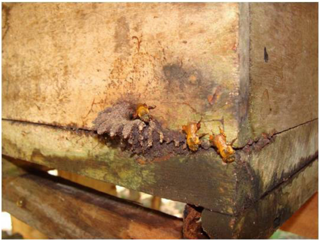
Fig 5 - Workers of Melipona flavolineata carrying resin in their corbicula after the treatment with mandibular gland extract of

by returning foragers has been reported for different species of stingless bees (Michener 1946; Kerr 1951; Sakagami & Laroca, 1963). The tests demonstrated that the behavioral responses are mediated by interspecific chemical signals which are secreted by the cephalic glands of the robber bee. The cephalic extract contains chemical secretions of the mandibular glands and the labial glands. The composition of the two glands differs substantially and the source of the repellent effect remains to be investigated (von Zuben, 2012).