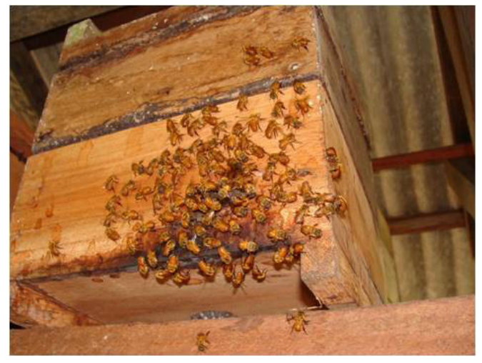
Fig 3 – Workers of Melipona flavolineata gathering outside the nest box surrounding the entrance after the deposition of L. limao cephalic extract.

Generalized agitation with workers flying quickly in angular flights and noticeable buzzing sounds occurred after both treatments but not in the control (Table 1). Some behavioural displays could only be observed in colonies treated with the mandibular gland extract, for example workers leaving the hive carrying resin in their corbicula and similar behaviour happening in neighbouring colonies (Table 1, Fig 5). Similarly, attacks to the pheromone site only were observed in the mandibular gland extract group (Table 1).