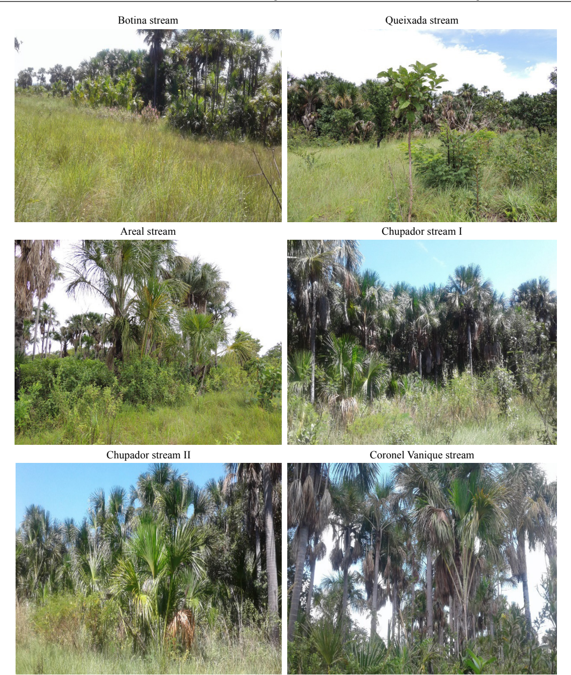
Fig 2. Landscape features of the six study Veredas in the Cerrado–Amazon transition zone in the municipality of Nova Xavantina, in Mato Grosso state, central Brazil. Botina stream, Chupador stream I and II, Areal stream, Coronel Vanique stream, and Queixada stream.

The species accumulation curve (Figure 3) indicates that the sampling efficiency of the present study provided a reliable estimate of the social wasp species richness found in the palm swamps of eastern Mato Grosso. Specifically, the observed species richness represented 93% of that estimated by the Jackknife procedure.