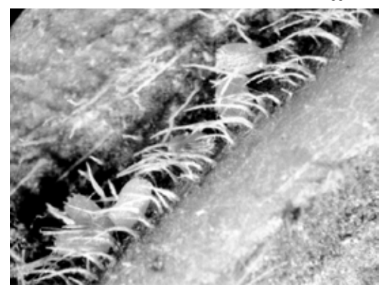
Fig. 1. Photograph of the eggs of the predatory month A. ignipicta laid on a S. senanensis leaf (among the spiny trichomes) in the center of a colony of the eusocial aphid C. japonica .