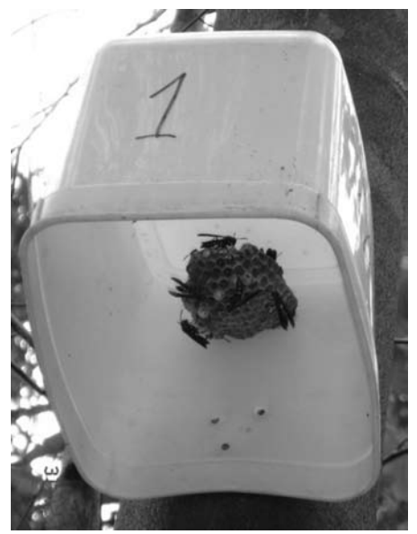
Fig. 1. A colony of Polistes versicolor in an artificial shelter.

We conducted a daily census for 123 days in the monoculture to check transferred colonies. The success of the transference technique was considered by the individuals' presence in the colony at least five days after transference. From this time on, we verified the time in which colonies were actives, as determined by individuals' presence in the colonies on the following days after the colony success evaluation period. When no individual was found in the nest for three consecutive days, we considered this the end of the colony activity period.