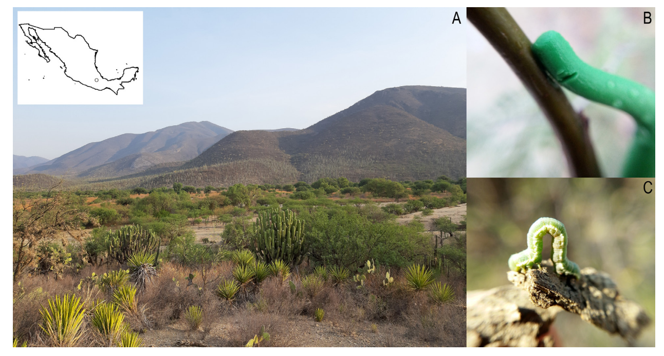
Fig 1. A. Study area within the Helia Bravo Hollis botanic garden (Zapotitlán Salinas, Puebla, Mexico), highlighting the area dominated by the thorny shrub Prosopis laevigata (Fabaceae). B. Dummy caterpillar with a mark left by an ant species. C. Lepidoptera larvae from the Geometridae family observed in the study area.

The use of dummy caterpillars has the potential to provide insights into the influence of a constant provision of resources on ants' responses towards potential herbivores. In general, models made of plasticine are distributed over the branches or leaves to resemble Lepidoptera larvae feeding on plants (Low et al., 2014; Roslin et al., 2017). When trying to feed on or attack the dummy caterpillars, different animal groups leave distinct marks, allowing their identity to a coarse, but informative, taxonomic level (e.g. birds, reptiles or chewing insects) (Low et al., 2014) (Fig 1B). These models have already provided useful information about the effects of plant and vegetation structure (Leles et al., 2017; Frey et al., 2018) and caterpillar characteristics (Hossie & Sherratt, 2012) on the relationships between caterpillars and their natural enemies. Ants have been shown to be responsible for most of the attacks on dummy caterpillars (Roslin et al., 2017), evidence that caterpillar models are efficient tools to assess the ants' response towards herbivorous arthropods (Leles et al., 2017).