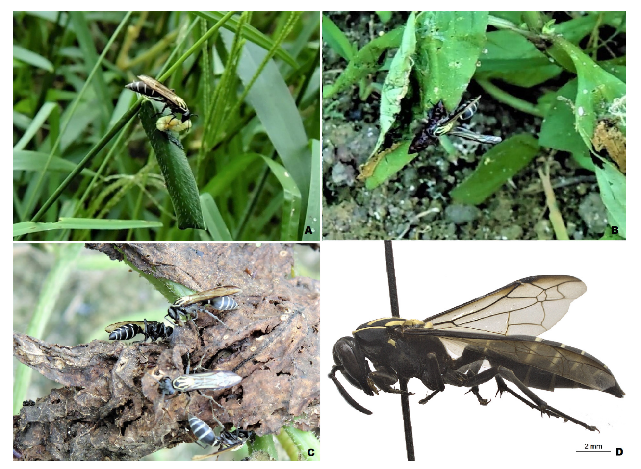
Fig 2 . Polybia liliacea preying on Diaphania hyalinata : (A) fifth instar larvae; (B) pupae; (C) Polybia liliacea in pupation site; (D) P. liliacea in lateral view.