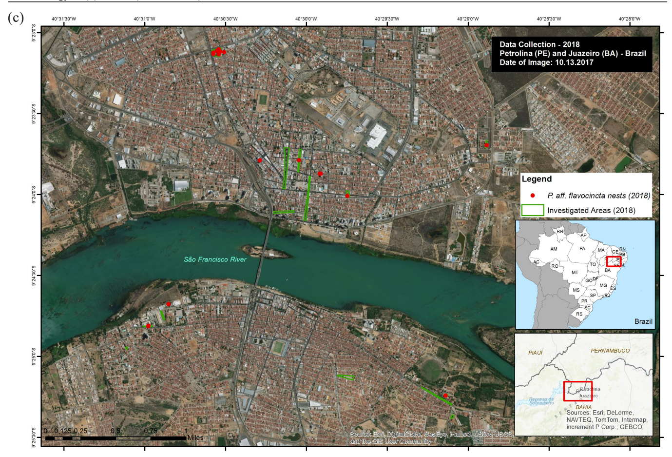
Fig 1. Images of satellite that show GPS points where nests of Plebeia aff. flavocincta nests were sampled in Petrolina and Juazeiro, in 2009 (a), 2015 (b) and 2018 (c).