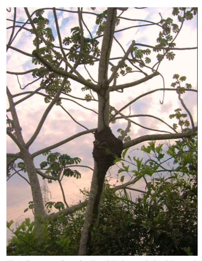
Fig 1: Cecropia pachystachya Trécul (Urticaceae) in South-Pantanal, Brazil, with a nest of Nasutitermes ephratae Rambur (Termitideae). Note the galleries spreading in trunk and branches.

Ants crossed the defined 10 cm<sup>2</sup> area in C. pachystachya individuals with and without termite nests, respective-