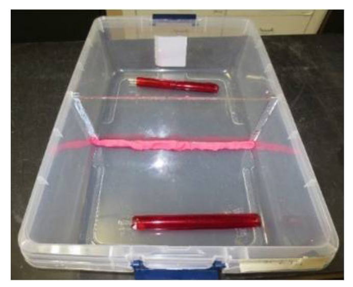
Fig 1 . Brachyponera chinensis nest emigration arena (60.9 cm x 42.6 cm x 16.7 cm) with test tube (250 mm x 25 mm) harborages, plexiglass insert, and Play-Doh® lining. Test tubes are wrapped with red cellophane paper with a moistened 8-cm sponge inserted. During experimental trials, the plexiglass insert, Play-Doh®, and one harborage were removed allowing the ants to freely move in the arena.

ants being carried in 15-minute intervals was compared using a Repeated Measures MANOVA in SAS 9.3 (SAS Institute, Inc. 2012. Cary, NC). A P-value of < 0.05 indicated statistical significance. All raw data provided as Supplementary Material.