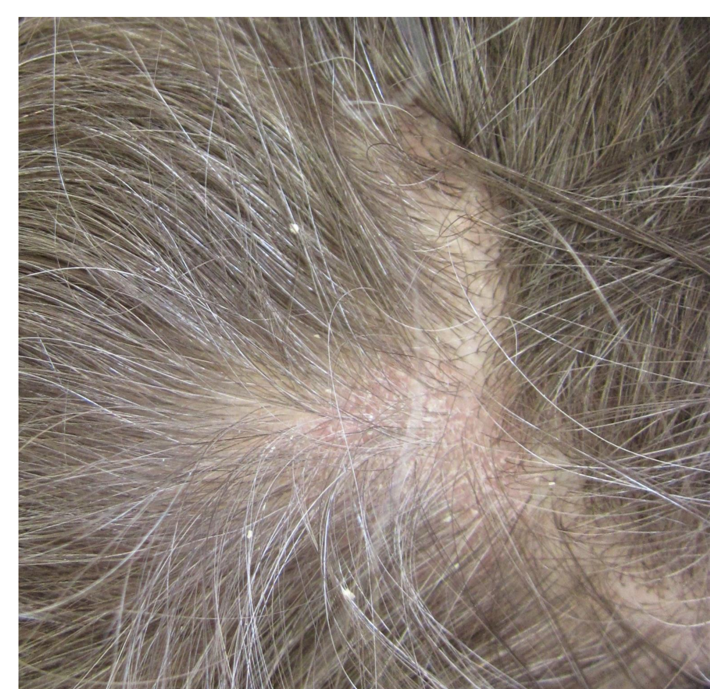
Patient 2 Scalp baseline

Patient Two: The second patient stated she had achieved clearance with the combination regimen at 2 weeks, but was showing some signs of flare at week four despite continued use of calcipotriene foam, 0.005% twice daily as prescribed. She reported that she had seen signs of return of disease 1 week after stopping halobetasol foam, but continued on the prescribed regimen of calcipotriene foam twice daily until her follow-up visit. She stated very high satisfaction with the two foam vehicles and the results achieved with both in combination for 2 weeks. She attributed her compliance to the prescribed regimen to her satisfaction with the quick penetration of the foam vehicles, their lack of residue, and absence of burning upon application as compared to prior treatments. She stated she had experienced no adverse events related to combination use. She was resumed on 2 weeks of combination use to be followed a rotating regimen of calcipotriene foam twice daily with halobetasol foam twice weekly to maintain clearance.