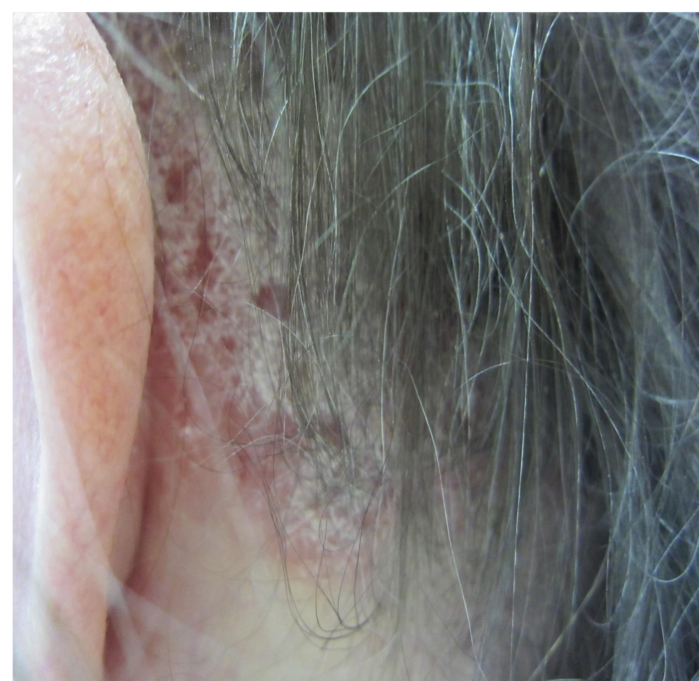
Patient 1 Left ear baseline

Patient One: At the Week 4 follow-up visit the patient's psoriatic lesions on the treated areas were clear. She stated she had achieved clearance with the combination of calcipotriene and halobetasol foams after the first 2 weeks. She then stopped use of halobetasol foam, 0.05% and remained clear with the continued use of calcipotriene foam, 0.005% a few times per week in the 2 weeks leading up to her follow-up visit. She stated high satisfaction with the results achieved in the 2 week combination period and the lack of return of disease during her time using calcipotriene foam alone. She stated a higher satisfaction with the foam vehicles compared to prior treatments she had tried; noting that the foams penetrated quickly, with no burning, and left no residue. She experienced no adverse events related to combination use. She has been prescribed to continue use of calcipotriene foam, but to return to the twice daily regimen.