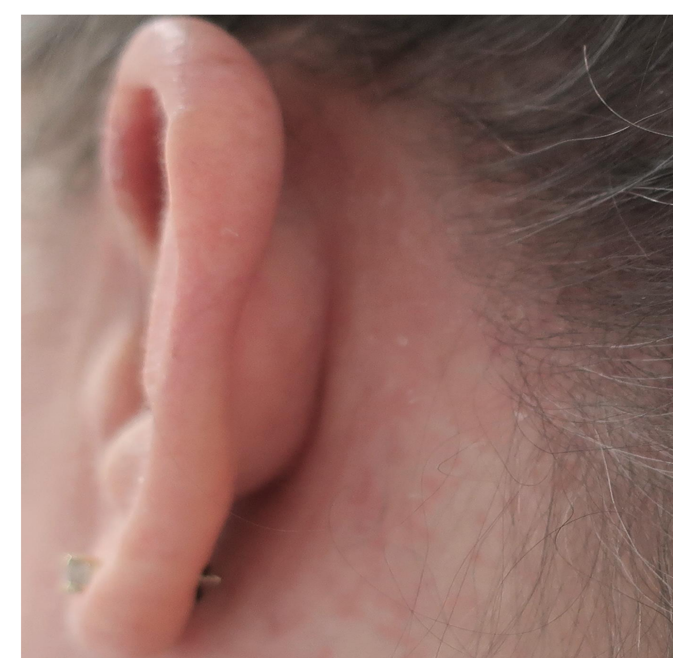
Patient 1 Left ear at Week 4