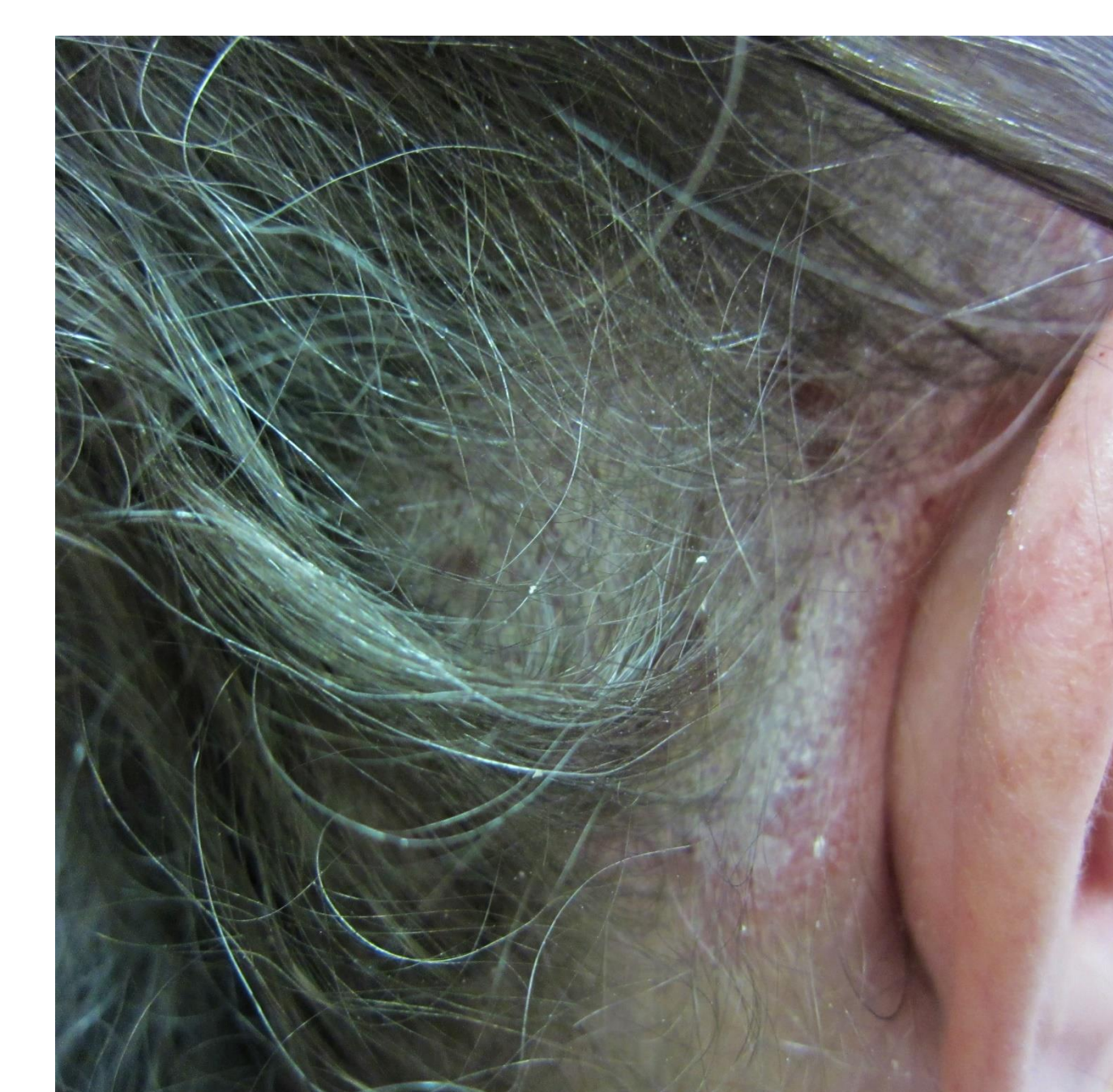
Patient 1 Right ear baseline