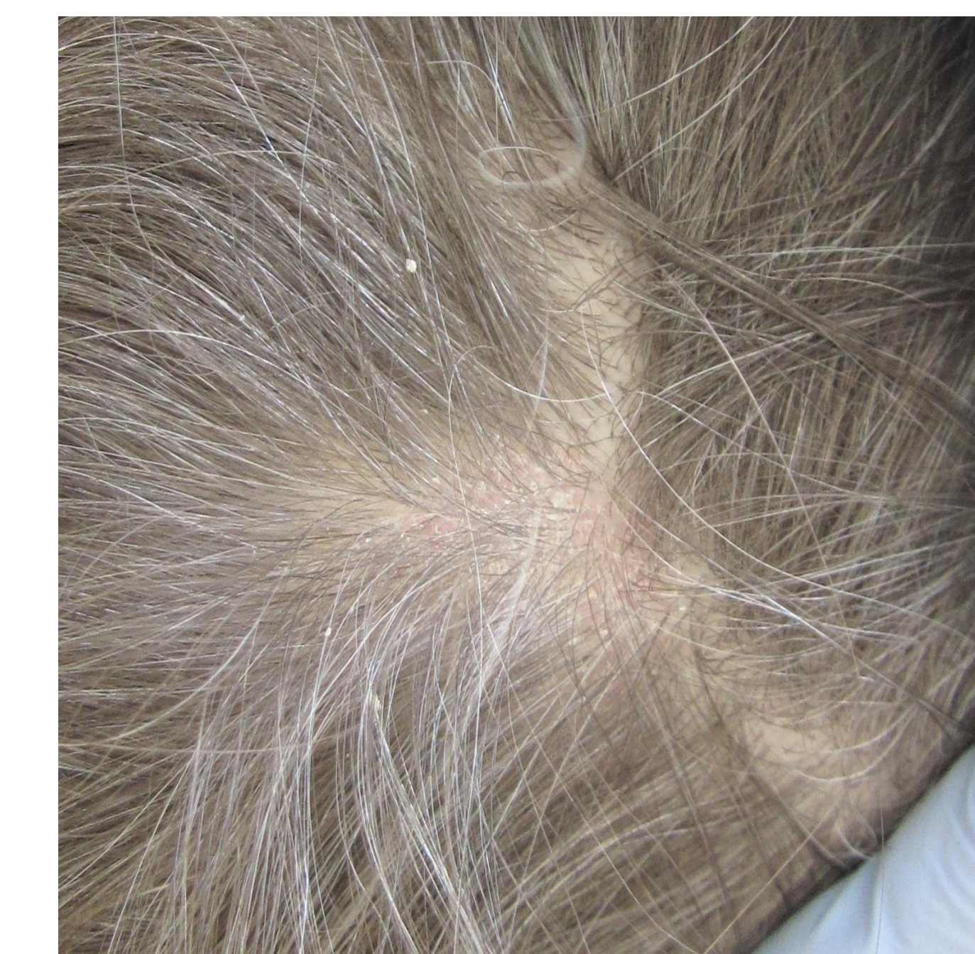
Patient 2 Scalp baseline