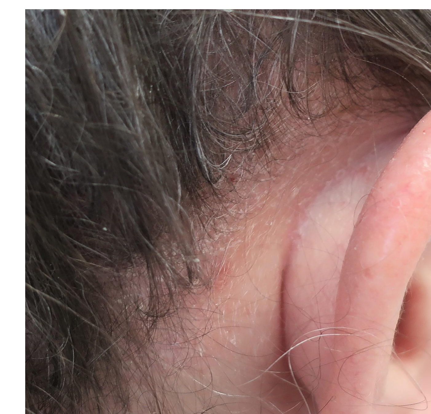
Patient 1 Right ear at Week 4

Patient Two: The second patient stated she had achieved clearance with the combination regimen at 2 weeks, but was showing some signs of flare at week four despite continued use of calcipotriene foam, 0.005% twice daily as prescribed. She reported that she had seen signs of return of disease 1 week after stopping halobetasol foam, but continued on the prescribed regimen of calcipotriene foam twice daily until her follow-up visit. She stated very high satisfaction with the two foam vehicles and the results achieved with both in combination for 2 weeks. She attributed her compliance to the prescribed regimen to her satisfaction with the quick penetration of the foam vehicles, their lack of residue, and absence of burning upon application as compared to prior treatments. She stated she had experienced no adverse events related to combination use. She was resumed on 2 weeks of combination use to be followed a rotating regimen of calcipotriene foam twice daily with halobetasol foam twice weekly to maintain clearance.