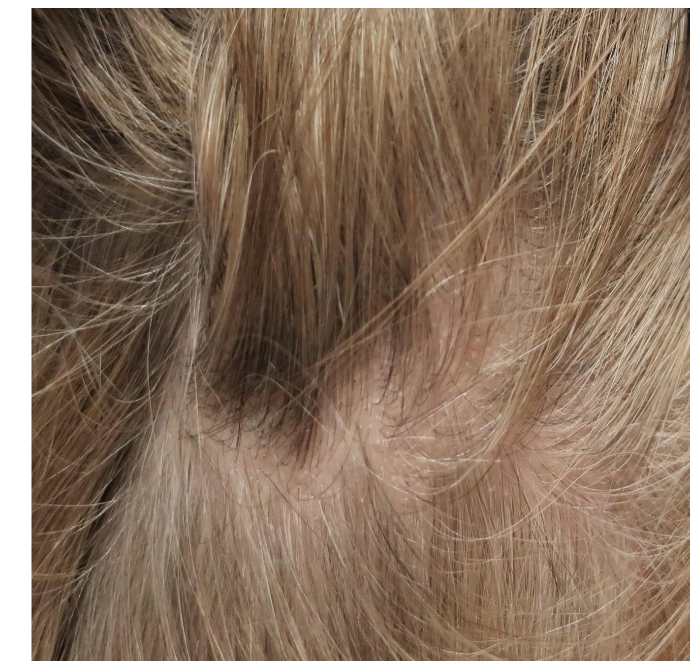
Patient 2 Scalp at Week 4