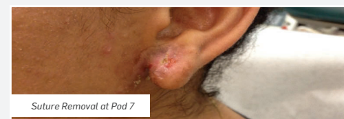
Suture Removal at Pod 7