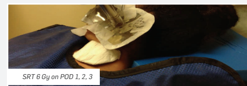
SRT 6 Gy on POD 1, 2, 3