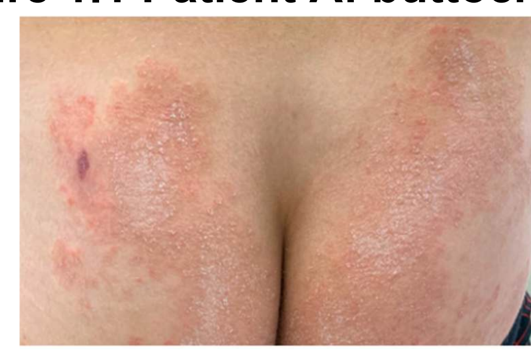
Figure 1.1 Patient A: buttocks and left shoulder