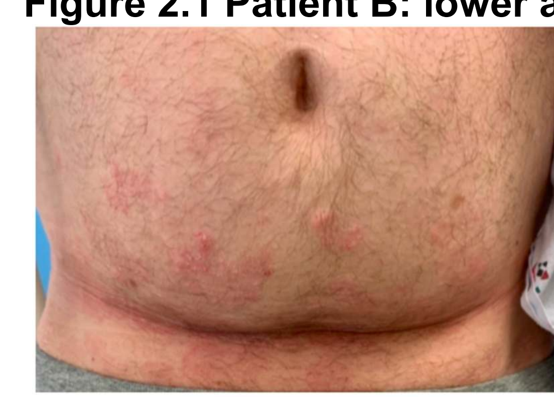
Figure 2.1 Patient B: lower abdomen and posterior thighs