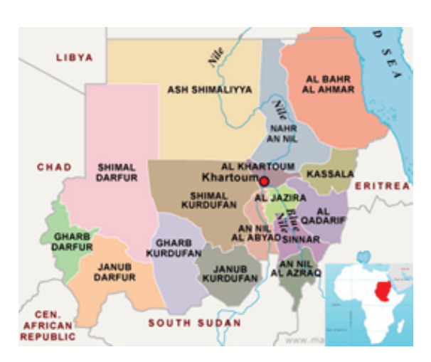
Figure 2: Map of the Republic of the Sudan.

The Republic of the Sudan is located in north-east of Africa and is the third largest African country in terms of geographical range after Algeria and Democratic Republic of the Congo, covering an area of 1.9 million km<sup>2</sup> States. Sudan has international borders with seven countries: Egypt, Eritrea, Ethiopia, South Sudan, Central African Republic, Chad and Libya [5]. In 2011, under the terms of the Comprehensive Peace Agreement, the Republic of South Sudan formed in formerly known as southern Sudan states. After the separation, the Sudan lost 75% of the oil resources and almost half of the country's revenue. Consequently, the Sudanese economy suffered losses from the withdrawal of oil revenues and annual percentage of growth rate of gross domestic products (GDP) decreased from 7.8% in 2008 to 3.1% in 2014 [5].