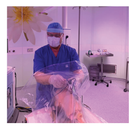
Figure 3 : Combined intubation with glidescope and covering the patient chest and head with transparent plastic sheet for double protection.