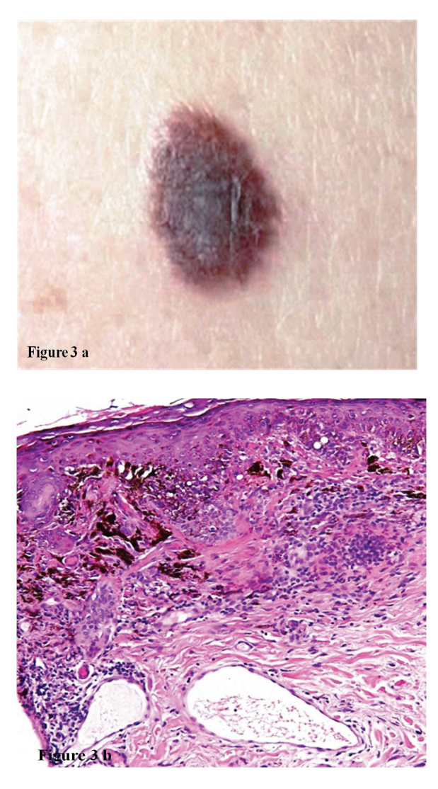
Figure 3: Atypical/dysplastic nevus on the trunk with irregular borders and variegated color distribution. Figure 3b at 40 x: Atypical/dysplastic melanocytic nevus exhibiting architectural asymmetry, vague borders and irregular pigmentation of dermal nevus cells. Nevus cells show nuclear hyperchromasia, and dusty melanin are spindled and parallel to the surface. Note the bridging of irregular and adjacent rete ridges and vascular dilation.