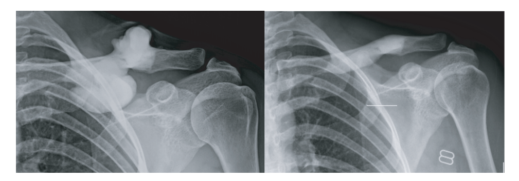
Figure 1 : Left shoulder radiographs showing osteodense solid homogenous mass around the mid-clavicula in preoperative imaging (a) and postoperative imaging (b).

years ago due to similar complaints was reported as compact bone tissue. The lesion, which was first noticed as a palpable mass five years ago, was followed up. She had a solid fixed, non-tender bony mass with bumpy lines. Physical examination revealed limitation of shoulder abduction and internal rotation, and tension on the palpable mass. Radiological examination revealed a solid sclerotic mass, 63×29 mm-sized, lobulated contoured, extending to the clavicular cortex (Figures 1, 2). A cortical thickening of the clavicular bone adjacent to the well-circumscribed mass was observed, which was attached to the clavicle with a wide border, but there was no invasion, bone destruction, or soft tissue involvement (Figure 2). The patient requested surgical removal of the mass due to pain, cosmetic reasons, shoulder limitation, and risk of pressure on sub-clavicular neurovascular structures.