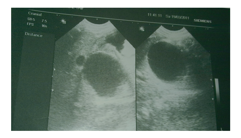
Figure 2: Ultrasound of the abdomen showing a cystic mass measuring 37 \times 33 mm at the epigastric region adjacent to the head of the pancreas.