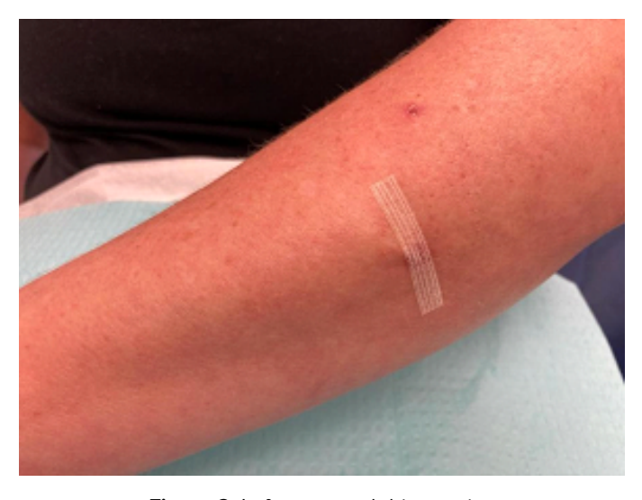
Figure 2: Left-arm punch biopsy site.