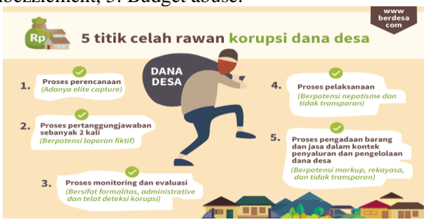
Figure 2 Recognize the Village Fund Corruption Modes

authorities because village funds are still regarded fresh and vulnerable to abuse (Taufik, 2017). Then at the implementation stage, risks arise when the community is judged unable to carry out their duties to the fullest, there is an opportunity to manipulate village development transaction evidence that is not in accordance with the RAB and RKPDes and there is a potential for delays in infrastructure development due to the implementation of village fund disbursement stages that are not in accordance with needs (Taufik, 2017). Furthermore, at the administration stage carried out by the village treasurer, the risks that can occur are data manipulation in SISKEUDES and proper reporting deadlines at the end of the village fund budget year which require the village treasurer to administer. At the accountability stage, the risk of fraud is due to the abuse of authority by village officials (Taufik, 2017). Figure 2 explains that there are 5 gap points prone to village fund corruption, including: 1. Budget inflation, 2. Fictitious activities/projects, 3. Fictitious reports, 4. Embezzlement, 5. Budget abuse.