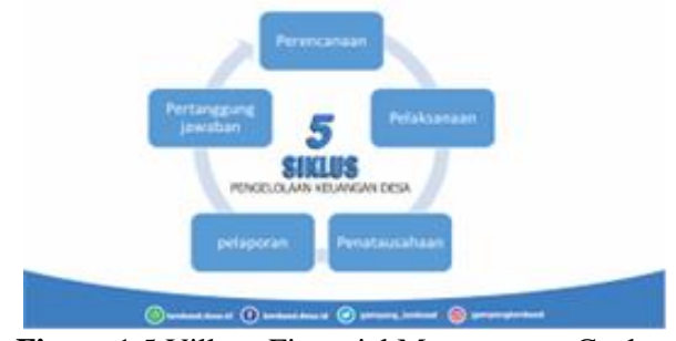
Figure 1 5 Village Financial Management Cycle

The village, which is based on origins and customs recognized by the national government system and is situated in the Regency region, is a legal community unit with the power to control and administer the interests of the local community (Amalia & Syawie, 2015). This is a form of government commitment by rolling out village funds. According to article 1 number 2 of Government Regulation number: 8 of 2016 concerning Village Funds it is explained that village funds are funds sourced from the APBN that are intended for villages and transferred through the City/Regency APBD and are used to finance government administration, development implementation and community empowerment. Based on Minister of Home Affairs Regulation number: 20 of 2018 concerning village financial management, it is also stated that village financial management is a whole activity which includes: planning, implementation, administration, reporting and accountability as depicted in figure 1 concerning Stages of Village Financial Management.