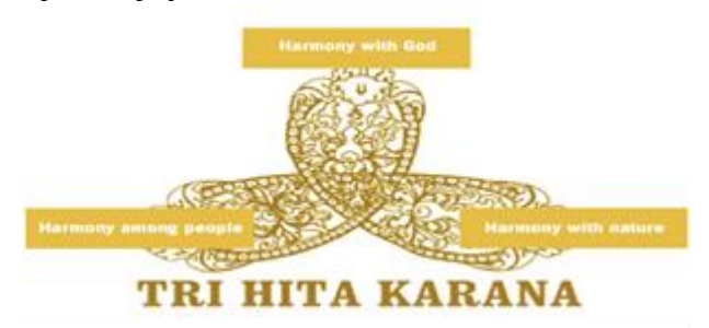
Figure 4 Tri Hita Karana

functioning as advice, beliefs, literature and taboos for local communities. Indonesia is very diverse and has various tribes and cultures that are part of local wisdom. For example, Kutuh Village is based on the Tri Hita Karana philosophy.