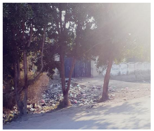
Fig 3: Dumping sites on the road

Poor or bad management of higher authorities has also been stated to be a major cause and ranked second. Management is the key to success for any organization in any situation but mismanagement, whether residential or commercial, can fail. Likewise, inadequate management of restaurants, commercial areas, and construction work contributes to a rise in the solid waste that can be avoided by creating an accurate management plan for each organization.