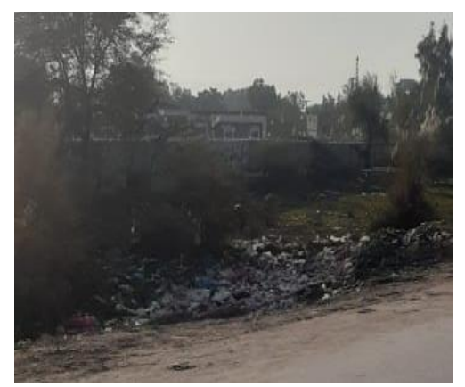
Fig 1: Open dumping by the community of solid waste on the road.

The second significant factor, as found by this study, is public awareness. The most common problem of the day now is a lack of knowledge about waste. It has been found that the public is not interested in reducing the production of waste but is increasing it by any means. The people do not accept it as their responsibility to reduce waste and dump it on roads that would make the world unpleasant and unsafe, and then start criticizing the government. The main role the public itself plays in this regard is to make them aware of the need of the hour through various social activities.