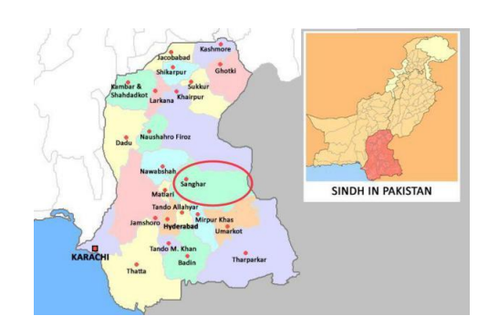
Fig 2: Sanghar district Map