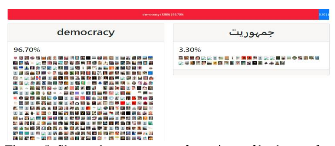
Figure 5: Shows the percentage of mentions of hashtags of two similar in different language (21:00 UAE ST)

The Figure 5 depicts the running filter only on democracy in Urdu and English language, with location restriction (set as Pakistan); found that English users scored 96.7% while Urdu users scored 3.3% (14:00 UAE ST).