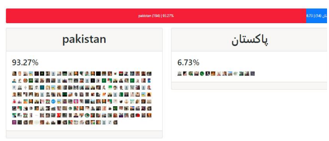
Figure 3: Shows the percentage of mentions of two similar words in different language between 21:00 and 00:00 UAE ST

The Figure 4 below depicts the running filter only on Urdu tweets mentioning Pakistan in Urdu and English, with location restriction (set as Pakistan), revealed that less 34.89% users use Urdu text and 65.11% use English.