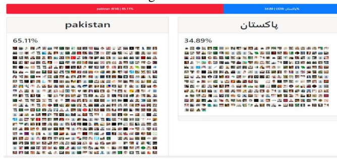
Figure 4: Shows the percentage of mentions of two similar words in different language (21:00 UAE ST)

The Figure 4 below depicts the running filter only on Urdu tweets mentioning Pakistan in Urdu and English, with location restriction (set as Pakistan), revealed that less 34.89% users use Urdu text and 65.11% use English.