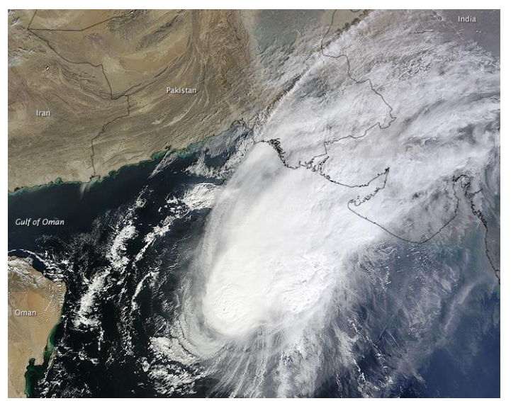
Figure 4: Tropical cyclone Nilofar in the last week of October 2014. This category 4 cyclone was a threat to the coast of Pakistan. This image was acquired by the Moderate Resolution Imaging Spectroradiometer (MODIS) on NASA's Terra satellite.

SJCMS | P-ISSN: 2520-0755 | E-ISSN: 2522-3003 © 2019 Sukkur IBA University – All Rights Reserved