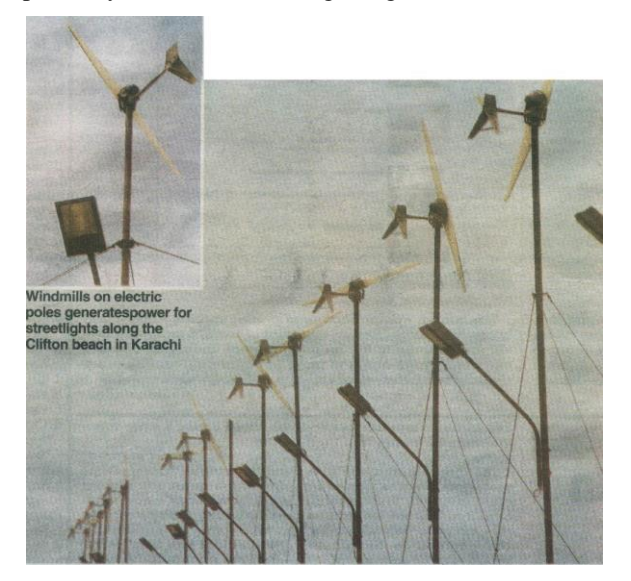
Figure 1: So-called wind farm installed at Karachi Beach and failed after few weeks.

A well-established commercial technology in developed countries does exist, which is largely unfamiliar to developing countries. Like for example, in Pakistan so-called wind farms were installed with great publicity through national media claiming sufficient generation of electricity for the need of nearby townships, which were failed after few months since the introduction of the technology was without proper study and basic knowledge (Figure 1).