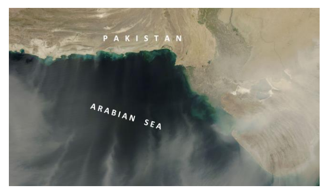
Figure 2: On March 20, 2012, a giant dust storm stretched across the Arabian Sea from the coast of Oman to India. The Moderate Resolution Imaging Spectroradiometer (MODIS) on NASA's Aqua satellite took this picture the same day. This extensive plume followed days of dust-storm activity over the Arabian Peninsula including Pakistan coastal belt.

Along the coastal belt of Pakistan, we have different trends of natural hazards. For example, the coastal areas of Sindh and Balochistan have frequent dust storms. The trend of these dust storms reflects different characteristics from one region to another (Nayyar and Zaigham, 2014). Along the coastal belt of Balochistan province, the impacted velocities of the dust storms are relatively much higher and stronger and they do carry coarser sediments (Figure 2 and Figure 3), which results in creating enormous abrasion, attrition and other physical & mechanical damages. On the contrary, along with the coastal areas of Sindh province these dust storms exhibit relatively low velocities and carry finer sediments. The main problem associated with such finer dust is that they can inhouse and stick to the sensitive components of the wind machines and also to the other mechanical devices and can reduce their working life, if appropriate and suitable systems are not design under these specific prevailing climatic conditions.