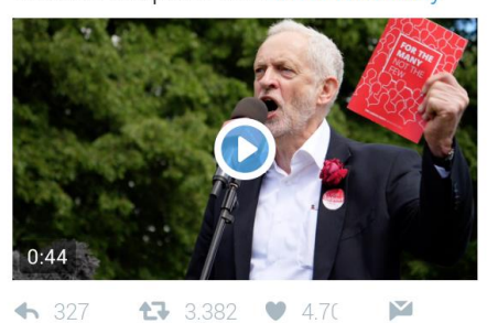
FIGURE 4. The terms "hope" and "fear" are often used in political campaigns as part of a binary opposition strategy that makes it easier for people and politicians for self-identifying while pointing at opponents with negative labels. This is more of a symbolic war than referring to the true meaning of the words itself<sup>12</sup>.

Jeremy Corbyn ② @jeremycorbyn · 2 h ∨ In few hours that remain in #GE2017 ③ , talk to your friends, your neighbours. It's a choice, quite simply, between hope or fear #ForTheMany