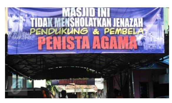
FIGURE 5. A number of mosques in Jakarta had banners that stated it will not perform funeral prayer for those who support religious blasphemer, Ahok's Muslim supporters<sup>19</sup>.

religion was considered as influential in daily life.