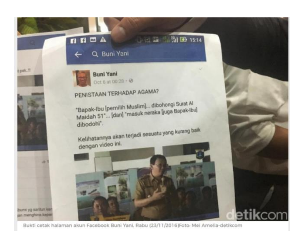
FIGURE 1. Print out of Buni Yani's Facebook status that triggered wave of demonstrations, which ultimately brought down Ahok from the position of Governor of Jakarta<sup>7</sup>.

It was just one word, but exactly the one that generated public uproar. The omission of the word "using" had wide impact in terms interpretation of Ahok's statement. insisted that presence/absence of the word "using" had no effect on the negative meaning of the sentence because it was juxtaposed with words that implied negative connotation such as "fooled" and "deceived". negative interpretation was mirrored in the court's verdict following the accusation addressed to Ahok8.