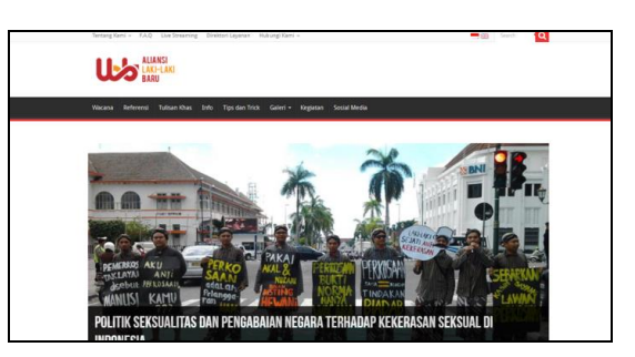
Figure 1. Aliansi Laki-laki Baru Official Website (http://lakilakibaru.or.id/)

ALLB uses their official website (<u>http://lakilakibaru.or.id</u>) as the main source of their information, agenda, and campaign. It can be said that the provides website already basic information and Frequently Asked Question (FAQ) that are usually asked by the readers related to various issues on gender equality and also the objectives of ALLB. They also provide clear contact information so the reader of this website can easily contact them engage directly and with the community.