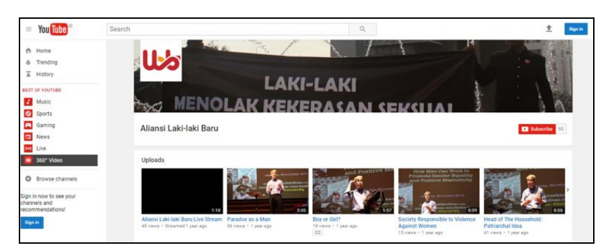
Figure 6 . Aliansi Laki-laki Baru YouTube Channel (https://www.youtube.com/user/lakilakibaru)

On their YouTube channel, ALLB only have 62 subscribers and there are 32 videos that have been uploaded until now. These videos are not only produced by ALLB, but also taken from other sources with credit. Regarding the number of viewers, most viewed video which got 5,782 views is a video entitled [anti rape campaign] If You Could See Yourself. This video shows a man who see himself raping a woman. The second most viewed post is a video entitled Understanding Gender Inequality which already got 5,451 viewers so far. This video contains a simple explanation about gender inequality.