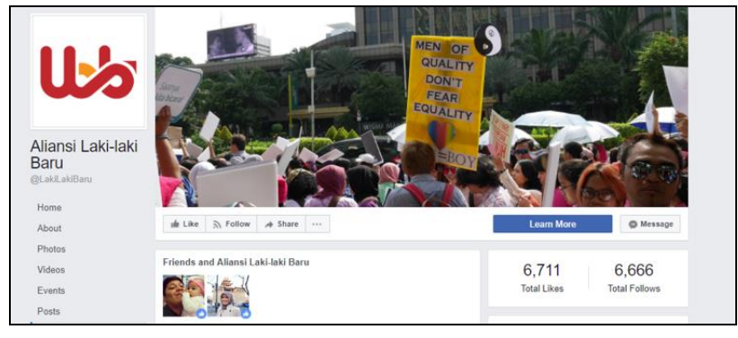
Figure 2. Aliansi Laki-laki Baru Facebook Page (https://web.facebook.com/LakiLakiBaru?_rdc=l&_rdr)

As one of the most popular social media, Facebook has been utilized by ALLB to promote awareness about gender equality and to invite people to join their community. ALLB uses a Facebook fan page and label their page as community. Through the analysis on their fan page, it can be seen that they use the platform to engage their partners or other movements that focus on same issue.