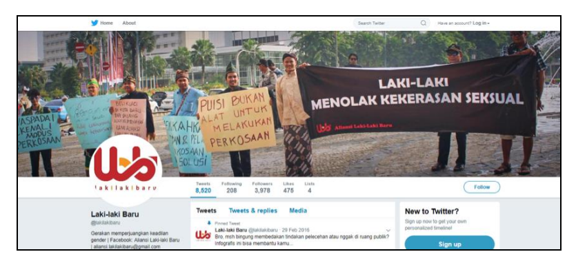
Figure 4. ALLB's Twitter timeline

It can be seen from ALLB's Twitter timeline that there is not much conversation happen. On one hand, this can happen because it can be said that today it is relatively difficult to use Twitter as a medium to carry on a conversation, especially on a fairly "heavy" topics such men's involvement in gender equality. Most of the Twitter users are now use the platform predominantly to search and share information. On the other hand, however, Indonesia is still seen as the fifth-largest country in terms of Twitter users, as confirmed by Twitter's head of business development for South East Asia and Australia, Dwi Ardiansyah (Jakarta Post, 2017).