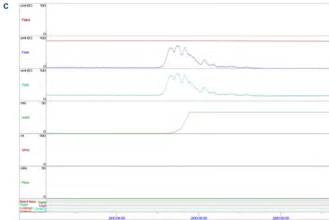
Extrapolated overnight aUDS trace showing high pressure DO (up to pp145cmH 2 O) and 220 mL leak

An 18-year-old female patient presenting with daytime frequency, urgency, and nocturnal enuresis (2 pads per 24 hours), Cont'd