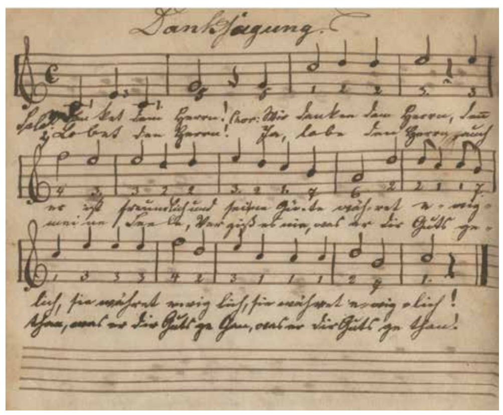
Figure 6: Personal Hymnal of Herrmann Sachtleben – Song with musical notation - detail.