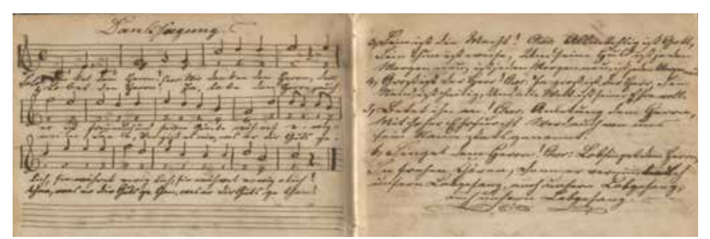
Figure 5: Personal Hymnal of Herrmann Sachtleben – Song with musical notation and 6 verses.