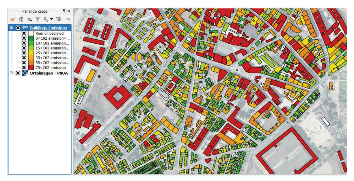
Figure 3: Estimation of the CO<sub>2</sub> emissions in the municipality of Medina del Campo using the tool