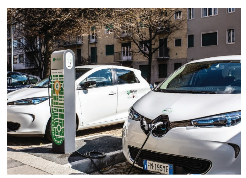
Figure 5: Building Car Sharing funded by the Sharing Cities project

As part of the project, e-logistics measures were implemented in order to counter the increase in conventional (particularly diesel) freight delivery vans, spurred by the growth of on-line commerce. The electric logistics interventions aim to be the business cases for new ways of urban emission free logistics: 9 e-vans and two e-cargobikes (and 11 charging points) were set-up in the project area, guaranteeing zero-emission logistics for a massmarket retailer. These e-vehicles replaced 10 vans used by the company responsible for providing logistics home delivery services for Carrefour, a large-scale distribution company, with several shops in Sharing Cities area.