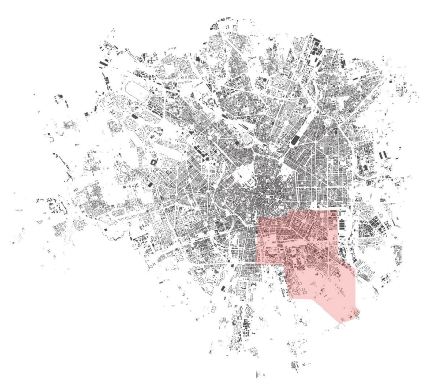
Figure 1: Map of Milan with Sharing Cities area

This paper presents Milan's demonstration of a smart district supported by the EU funded H2020-SCC1 project Sharing Cities (www.sharingcities.eu), aimed at creating a "smart" district with "near-zero" emissions in three different "lighthouse" cities, London, Lisbon, and Milan (Figure 1), to respond to the main urban environmental challenges and improve the daily life of its inhabitants. In