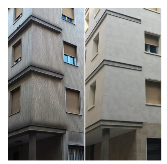
Figure 4: Private residential building pre and post retrofitting funded by Sharing Cities

management systems which serve for monitoring and managing the energy consumption. Such interventions are aimed at an average 60% reduction in energy consumption and at an increased comfort inside dwellings.