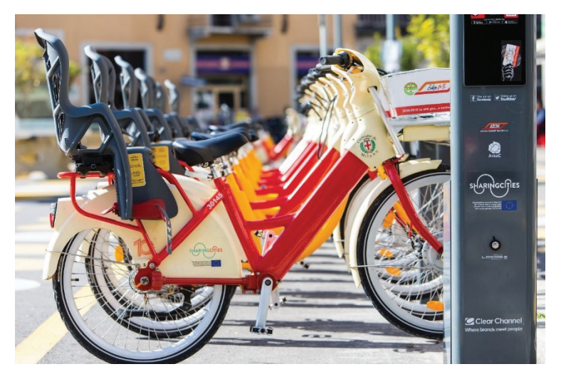
Figure 6: E-bikes sharing station funded by the Sharing Cities project

3) Smart Lampposts: from Humble to LED to Smart Lampposts