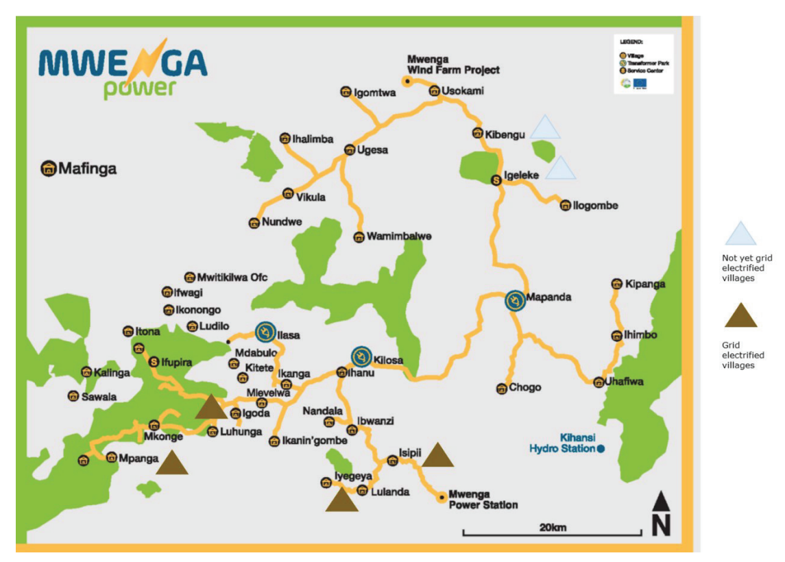
Figure 1: Map showing sampled grid-electrified and non- grid electrified villages in 2015

In Figure 1, the current Mwenga power network system is displayed. Grid-connected areas, mostly located in the south, received access to grid-electricity in 2012. By the end of 2015, when research data was collected, the villages in the north were still not connected to the mini-grid system. The mini-grid extension to the northern villages became operational in 2017.