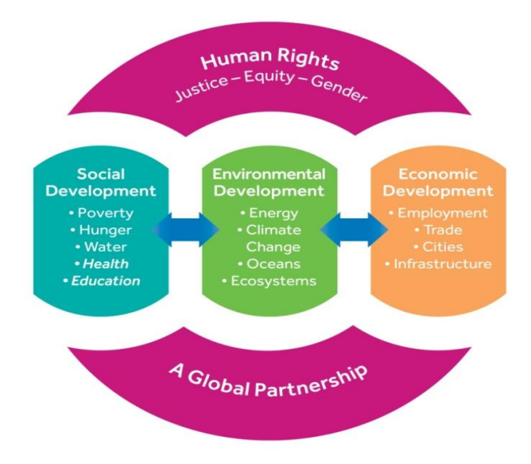
Figure 1: Visual representation of the overarching elements of the SDGs