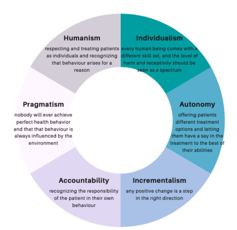
Figure 2: Hawk et al. (2017) Harm reduction principles for healthcare settings (46)

(individualism). Through the promotion of autonomy care negotiations will be based on the needs and wishes of the patient, thus strengthening the provider-patient relationship. Incrementalism encompasses the idea that any positive change is a step in the right direction towards improving the patients' health and stresses the importance of having a plan for dealing with backward movements. Finally, by recognizing the responsibility of patient in their behavior without penalizing them for not achieving goals we can help them understand the impact of their choices.