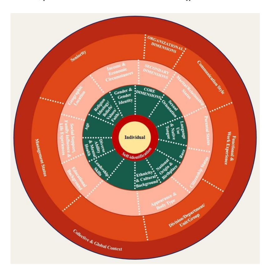
Figure 1: Dimensions of Diversity Wheel: A common way to illustrate the complexity of the concept of diversity. Core, secondary, and organizational dimensions are inextricably linked and impact one another. Empty spaces in the figure indicate that different components of dimensions are not set and can be changed depending on an individual (7)

Core dimensions are central to one's personal experience and have a long-term, direct impact on our lives. They are the dimensions with which we identify ourselves most strongly. Many of these aspects are more difficult to consciously modify (8). Though some of them may naturally evolve and be altered throughout our lives, the way we interpret them is frequently established during childhood and has a lasting impact on one's perceptions of identity (7).