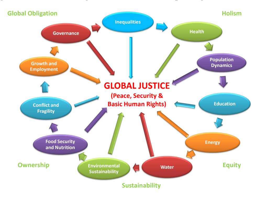
Figure 2. Towards an integrated sustainable development goals framework