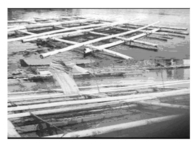
Plate 1. Installation of sinker in the floating net cages used in the study.

styrofoam box. The lobsters were transported early in the morning to the study area. Upon arrival, the box was opened and the experimental animals were unwrapped individually inside the cage. Lobster was held at surface of water, until they swam freely in the prepared cages. The floating netcages made up of bamboo poles (3.5 m. in length) were divided into 9 (1m x 1m) cage frames. A polyethylene B-net 1m x1m x 1.5m with a mesh size of 0.25 cm was used as netcages. These netcages were firmly attached to the cage frame. Reinforcement bar measuring 1 x 1 meter was placed inside the cage as sinker (Plate 1). For protection of cage net, perimeter net (2.50cm mesh size) was installed.