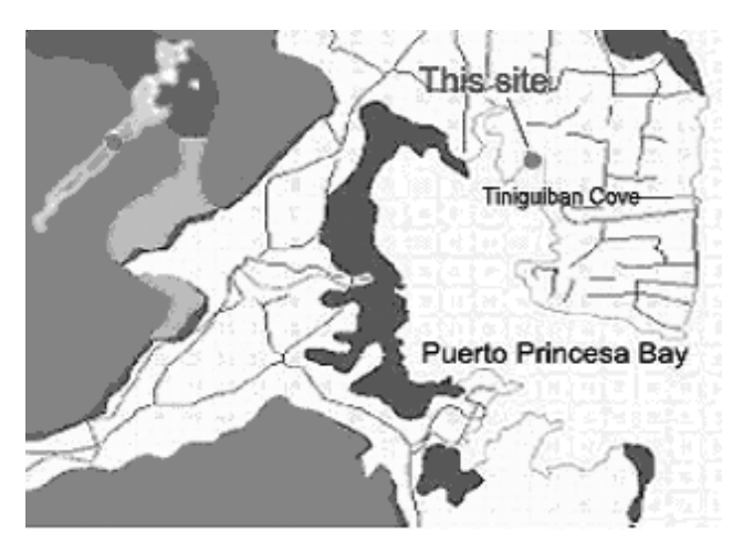
Figure 1. Map of Puerto Princesa Bay showing the experimental site.

Red spiny lobsters were collected from the offshore of Sabang, Puerto Princesa City. Forty five (45) individuals were collected and soaked in iced seawater for 3 to 5 seconds until they stopped moving. The animals were then wrapped individually by a piece of newspaper, and systematically arranged inside the