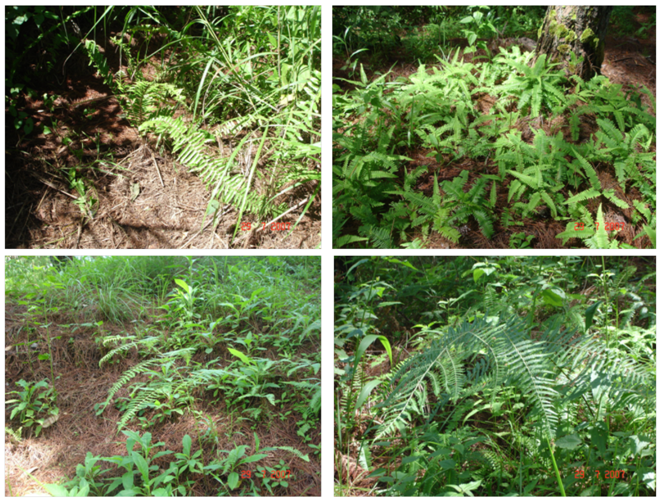
Figure 4 . Photographs of selected fern species found in the study area. Presented horizontally a) Nephrolepis hirsutula, b) Dicranopteris linearis, c) Pteridium aquilinum, d) Pteris sp.