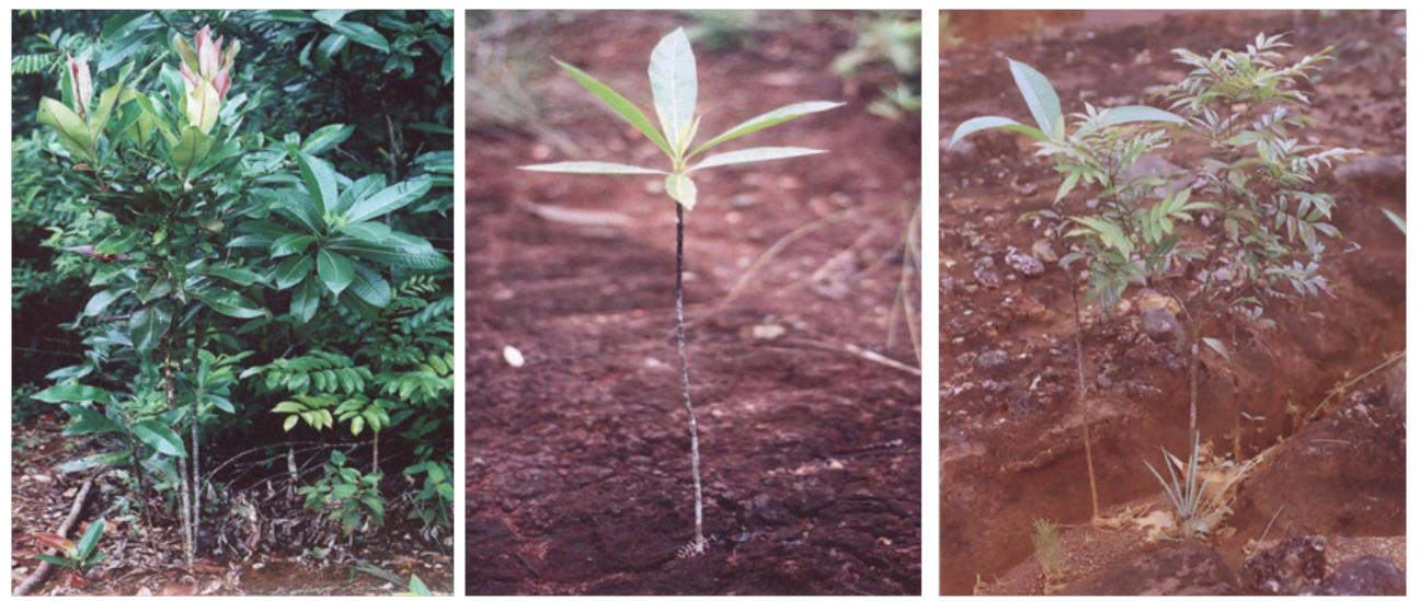
Figure 2. Photographs of some metallophytes found in nickeliferous laterite. a) Sapotac. planchonella found in Site 1 b) Apocynac. alstonia macrophylla found in Site 4 c) Cunoniac. weinmannia and Apocynac. alstonia macrophylla found in Site 5.

by the composition of the parent rock, which is the source of metals and various soil parameters such as pH, redox potential, ionic strength, competing ions and metal bioavailability (Singh & Steines, 1994; Dinelli & Tateo, 2001).