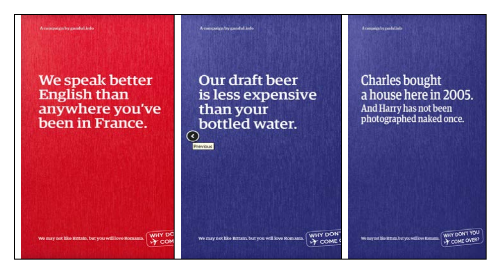
Figure 3 Successful posters in Why Don't You Come Over ? campaign

Designed as a positive campaign (Newsom, Turk & Kruckeberg, 2003), Why Don't You Come Over ? intends, at an early stage, to identify with humor the advantages of Romania over the United Kingdom: more beautiful girls, cheaper beer and better food, the idyllic landscape also appreciated by Prince Charles. Based on the message "We may not like Britain, but you will love Romania. Why don't you come over?", in the second stage of the campaign, the British are invited to find a "couch" offered by the Romanians to spend a few days in Romania and convince themselves of the truth in the posters' messages. In addition, on the www.whydontyoucomeover.co.uk website, a special section was added where employers Romanian could offer available jobs to the British.