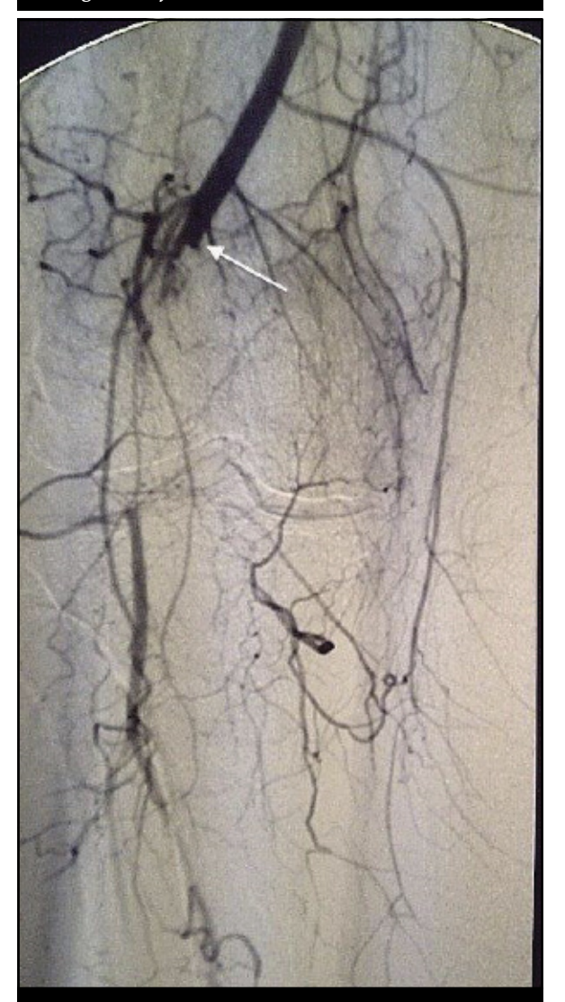
Figure 2. Angiogram; injury to the popliteal artery