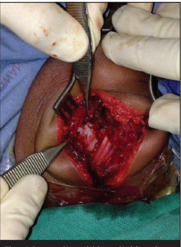
Figure 2. Intra-op picture of right proximal femur demonstrating sub-periosteal femoral collection. The sciatic nerve is shown just posterior to the area of interest.