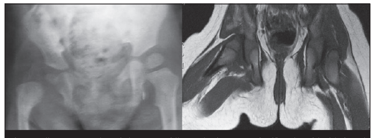
Figure 3. Follow-up X-ray and MRI (T1) at one-year follow-up showing presence of ossific nucleus of the right femoral head which is smaller compared to the left side. No evidence of infection. There is also dysplasia of the right acetabulum. No dissociation seen between the right femoral neck and shaft (Aitken type A).

Clinically patients typically present with a short and bulky thigh that is flexed, externally rotated and abducted.<sup>1-3,6</sup> A clinical paradox exists in that the 'hip joint' in PFFD is generally painless and relatively stable.<sup>7,8</sup>