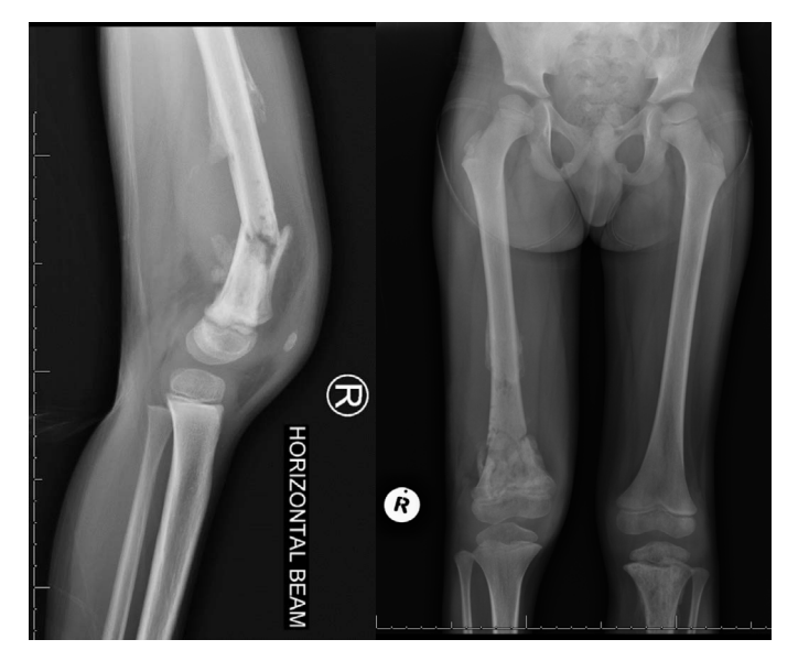
Figure 6 . Lateral and AP X-ray of a 5-year-old boy with a femur pathological fracture six weeks post admission for AHOM. Note the involvement of the left proximal tibia as well.

AHOM can cause devastating destruction of the bone due to tissue necrosis, leading to late sequelae like chronic osteomyelitis (1.7\%)^3 and pathological fractures<sup>5,23,31,36</sup> ( Figure 6 ). Complications such as these are more common in children in LMICs.<sup>50,54,55</sup> Belthur et al. described the incidence of pathological fracture as 4.6–5%; however, Popsecu et al. reported an incidence of almost 10%.<sup>31,119,120</sup> In addition, on admission, large subperiosteal abscesses extending into the muscle were more likely to fracture within 72 days of presentation.<sup>3,4,7,71,74</sup> The limb segment should be protected in the first six weeks to prevent a pathological fracture.<sup>42</sup> Calvo et al. reported that children with contiguous infections also had the highest incidence of surgery (46%), complications (18%) and sequelae (10%).<sup>56</sup>