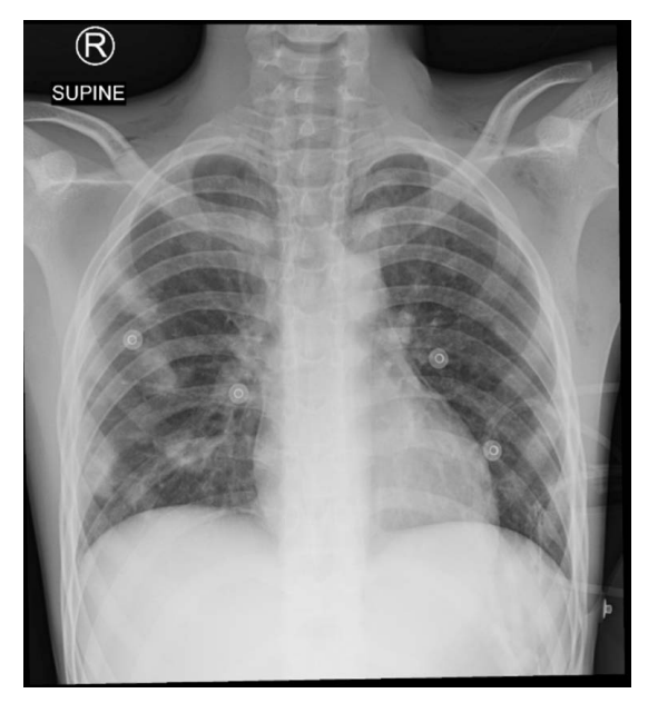
Figure 4 . Chest X-ray of a 15-year-old boy with staphylococcal septicaemia. He presented with a four-day history of depressed level of consciousness, fever, multiple swollen joints and tachypnoea.