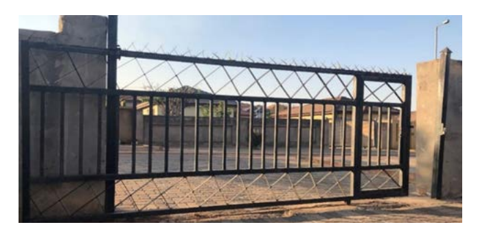
Figure 1. An example of a non-motorised sliding access gate in a semisuburban home

Numerous injury mechanisms are described in childhood fractures which can occur at home or the surrounding environment.