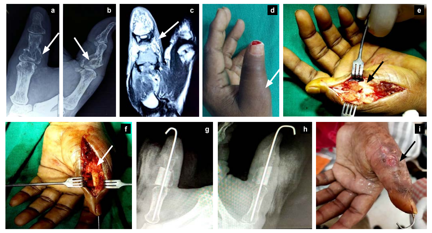
Figure 5. Benign lymphohistiocytic lesion involving proximal phalanx of thumb with pathological fracture

a) preoperative X-ray AP view (pathological fracture shown by arrow); b) preoperative X-ray lateral view (pathological fracture shown by arrow); c) MRI (lesion shown by arrow); d) clinical photograph (swelling at local site shown by arrow); e) intraoperative photograph (lateral approach shown by arrow); f) intraoperative photograph with graft (arrow); g) immediate postoperative X-ray AP view; h) immediate postoperative X-ray lateral view; i) follow-up showing superficial infection (arrow)