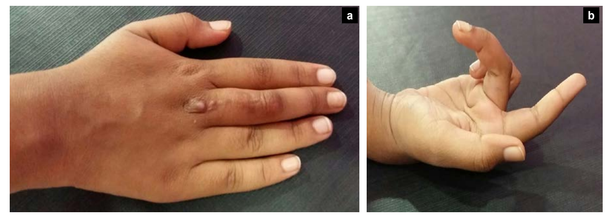
Figure 4 . Clinical follow-up of case shown in Figure 3 with movements of middle finger a) extension; b) flexion

a) clinical photograph (swelling marked by arrow); b) preoperative X-ray AP view (lesion marked by arrow); c) preoperative X-ray oblique (lesion marked by arrow); d) preoperative MRI (lesion with broken cortex marked by arrow); e) intraoperative photograph from dorsal side showing broken cortices and flexor tendon (marked by arrow); f) intraoperative photograph with fibula graft (arrow); g) immediate postoperative X-rays; h) final follow-up X-rays at one year