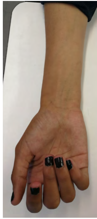
Figure 4. Same patient as in Figure 2, demonstrating her maximum active supination of the normal side