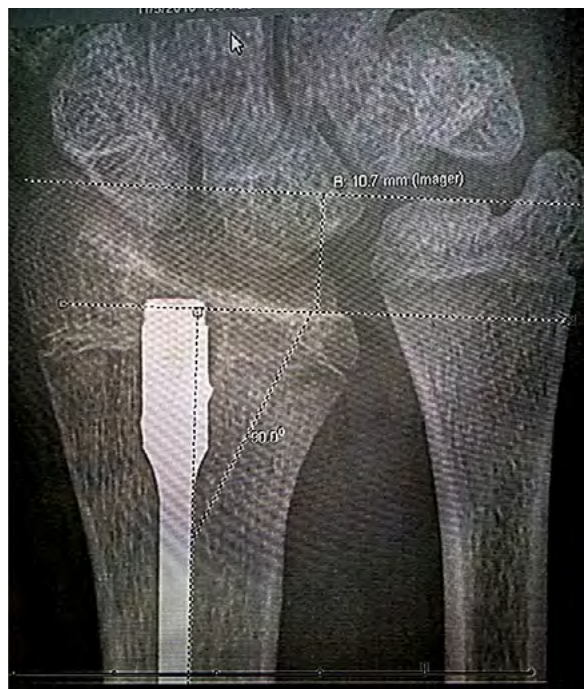
Figure 1. An example of how to measure ulnar variance: Draw a line tangential to the articular surface of the ulnar. Draw a second line tangential to lunate fossa of radius and perpendicular to shaft. Measure the distance between these two lines. In this example, the UV is measured at 10.7 mm, and would be considered shortened in this study (normal: UV -4.1 to +2.3).

The entry point, just ulnar to Listers tubercle and 5 mm proximal to the articular surface, is found with the aid of fluoroscopy. A 1 cm dorsally based longitudinal incision is then made, and blunt dissection performed down to the bone, taking care to avoid injury to the extensor pollicis longus tendon or a small branch of the radial sensory nerve that may cross the surgical field. The near cortex is breached with the entry awl, paying careful attention to the AP and lateral direction of the awl. Inaccuracy of these initial steps, particularly in the AP plane, can result in a malreduction of the radius bow. Directing the awl in a slight radial direction can aid in avoiding