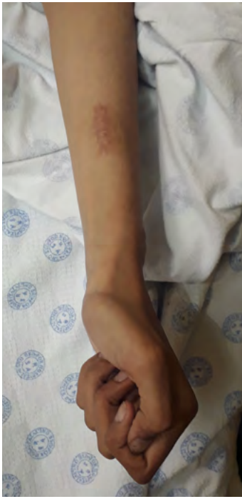
Figure 3. Same patient as in Figure 2, demonstrating her maximum active supination of the affected side