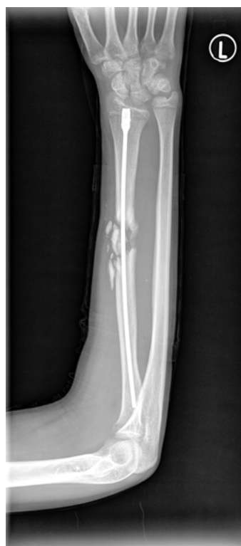
Figure 2. An AP X-ray of a patient, taken three months post surgery. Note the significant ulnar plus (measured at 11.7 mm). She presented with functional loss of supination, requiring revision surgery.