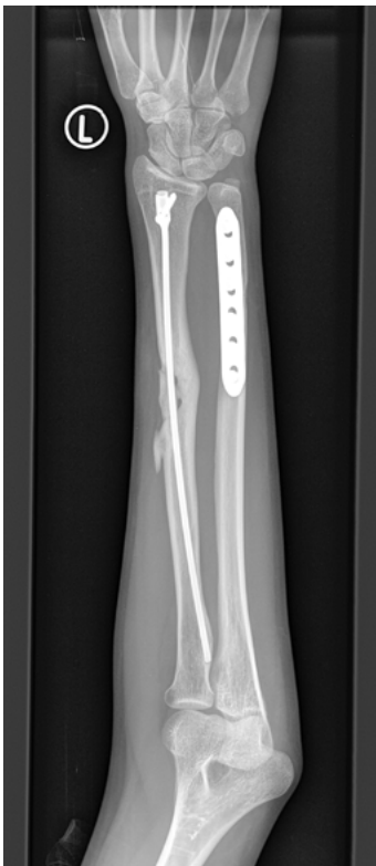
Figure 5. An AP X-ray of the same patient (Figure 2), following an ulnar shortening osteotomy and plating aimed at restoring her native distal radial ulnar joint relationship